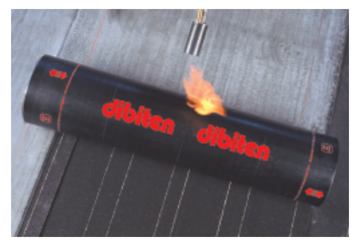
Dibiten Poly/4 APP (Heat Welded)